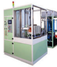
Induction Hardening Machine