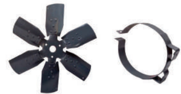
Diesel Genset Industry