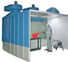
Spray Painting Machine