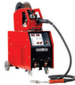
MIG Welding Machine