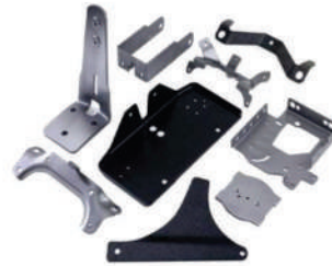
Office Chair Industry