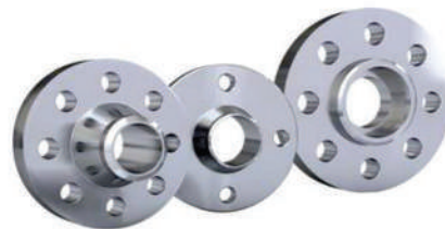
Oil & Gas Industry