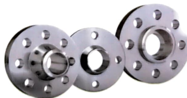
Oil & Gas Industry