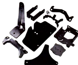
Office Chair Industry