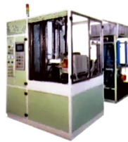
Induction Hardening Machine