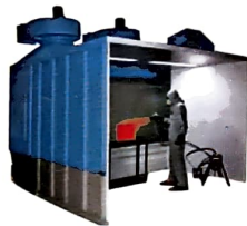
Spray Painting Machine