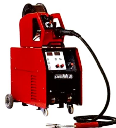
MIG Welding Machine